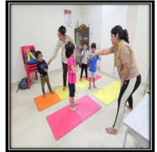
Yoga Group Session