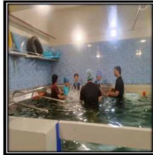
Aqua therapy Group Session